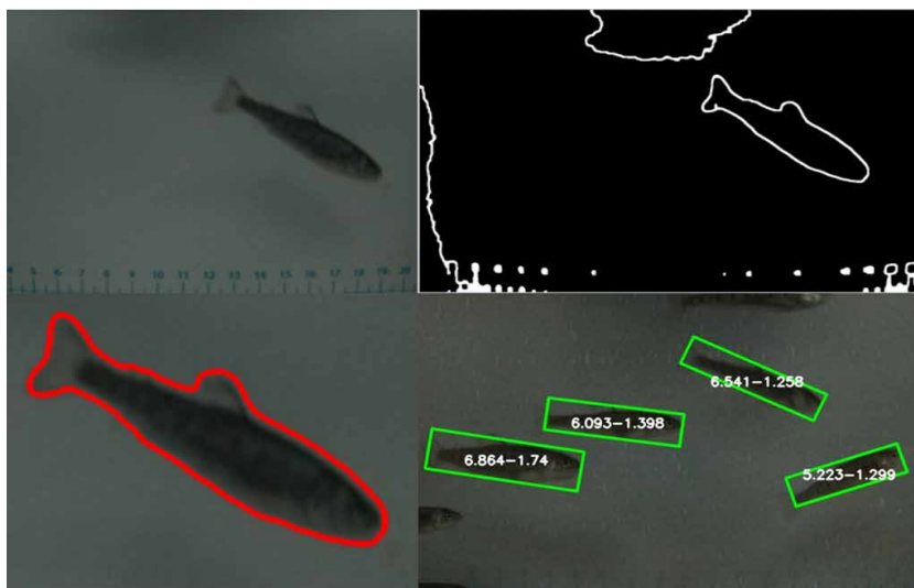
Figure 3 Image processing

images until finding the contours of each fish present in the image. Next, estimation of length is made by calculating the Pixel per Metric Ratio from a calibration image taken first with a ruler in the background. This establishes the total length of the image and its equivalent in pixels. The length and height of the contour are converted to cm using this ratio. The steps taken and intermediate results are as seen in Figure 3